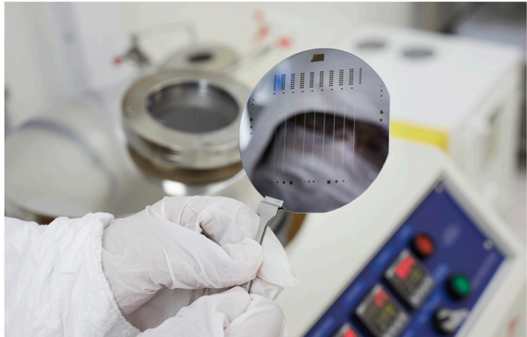
Silicon wafers of thin-film microfabricated electrodes can be implanted into a patient to record from or stimulate the nervous system—the vagus nerve in particular.

Driving growth in bioelectronic medicine is a convergence of advances in neuroscience, electronics, materials science, molecular medicine, and biomedical engineering, alongside more than a billion dollars of investments from government and industry. Within the next decade, researchers say, modulating the body's neural networks could become a mainstream therapy for many of today's greatest health issues—from arthritis (1), asthma (2), and Alzheimer's disease (3) to depression (4), diabetes (5), and digestive disorders (6, 7). Stimulating nerves also shows promise in treating cardiovascular disease (8) and septic shock (9), even in improving cognition (10).